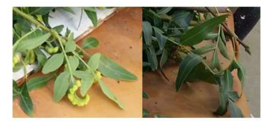
Figure 2. a-Leaves infested by aphids;b-Healthy leaves of Pistacia atlantica Desf.

We took two samples: healthy leaves, leaves infected, the samples were dried in the shade for about 15 days.