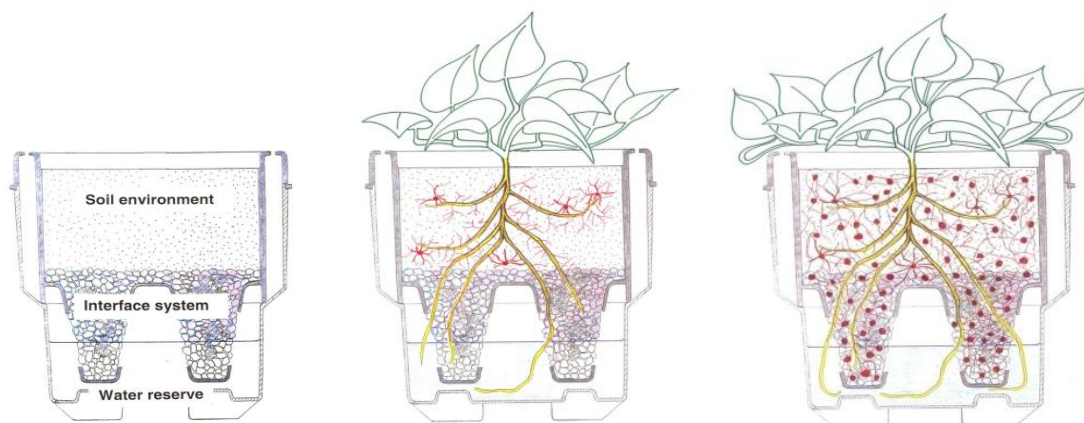
Figure 1. Biotopics system used to grow beans

Plants were grown in a greenhouse, utilizing biotop device, during 65 days, relating to the vegetative cycle of bean plants. After a week of development in a pot filled with potting soil, seedlings of the same length are transplanted into biotop boxes, filled with a layer of experiment soil (5 liters of potting soil per box), previously positioned on 4 liters of the inert medium which is cork granulate (Figure 1).