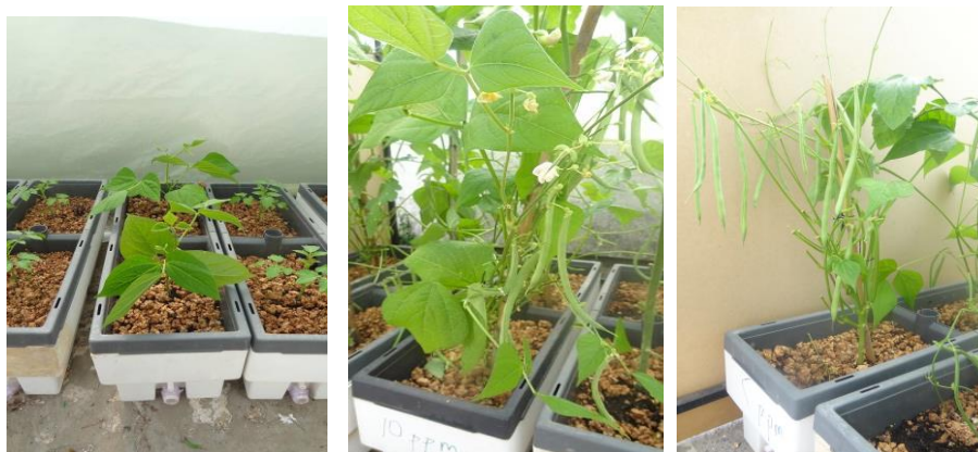
Figure 2. Green bean plants in biotop device

in dry matter of root system (DMR), of the stem (DMS), of leaves (DML), and fruits (DMF), were quantified using a Varian flame absorption spectrophotometer, with acetylene flame and hollow cathode lamp. Concerning the metal analysis of all samples it was performed using ICP AES atomic emission spectrometry (Ultima 2 – Jobin Yvon).